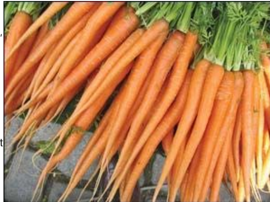
Area farmers will sell a wide variety of products at Saturday's Sparta Farmer's Market.

exact right time to do this in Sparta," said Morrison, "There are an overwhelming number of people in the area who: one, want to eat healthier foods that do not have to travel 3,000 miles to our table; two, want to know exactly where our food is grown and made; and